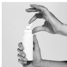
Figure A: Break tiny plastic piece on Olux-E Foam can nozzle.

1. Before applying OLUX-E Foam for the first time, break the tiny plastic piece at the base of the can's rim by gently pushing back (away from the piece) on the nozzle. See Figure A.