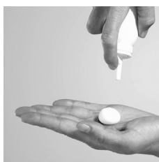
Figure D: Dispense Olux-E Foam into hand.

4. Dispense a small amount of Olux-E Foam into the palm of your hand. See Figure D.