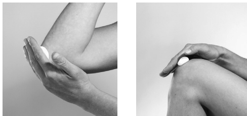
Figure E: Cover affected area with thin layer of Olux-E Foam. Rub foam gently into affected skin.

5. Use enough Olux-E Foam to cover the affected area with a thin layer. Gently rub the foam into affected area until it disappears into the skin.