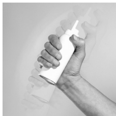
Figure B: Shake Olux-E Foam can.

2. Shake the Olux-E Foam can before use.