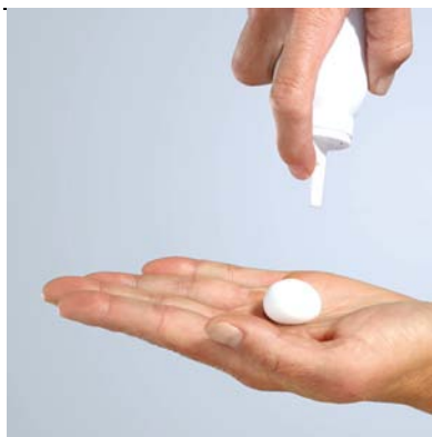
Figure D: Dispense Olux-E Foam into hand.

5. Use enough Olux-E Foam to cover the affected area with a thin layer. Gently rub the foam into affected area until it disappears into the skin.