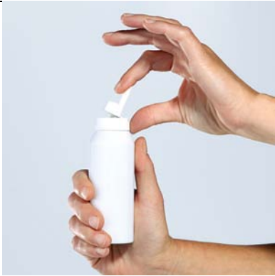
Figure A: Break tiny plastic piece on Olux-E Foam can nozzle.

2. Shake the Olux-E Foam can before use.