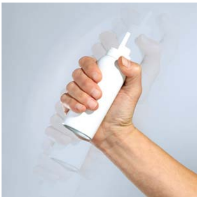
Figure B: Shake Olux-E Foam can.

2. Shake the Olux-E Foam can before use.