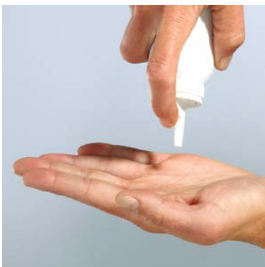
Figure C: Turn Olux-E Foam can upside down and press nozzle.

3. Turn the Olux-E Foam can upside down and press the nozzle. See Figure C.