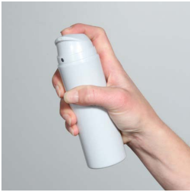
Figure C: Hold can upright and press nozzle firmly to dispense.