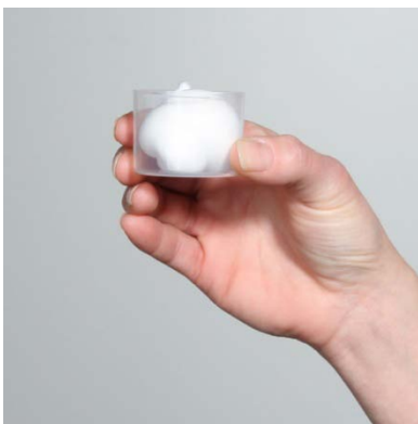
Figure E: Dispense enough EVOCLIN Foam to cover affected area.