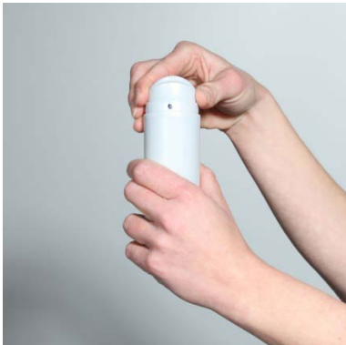
Figure B: Line up the black circle with the nozzle.