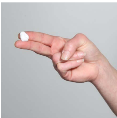
Figure G: Pick up a small amount of EVOCLIN Foam on your fingertips and gently rub into the affected area until the foam disappears.