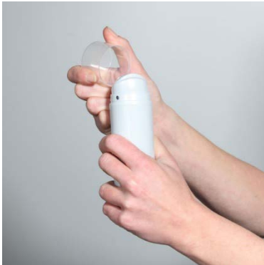
Figure A: Remove clear cap.