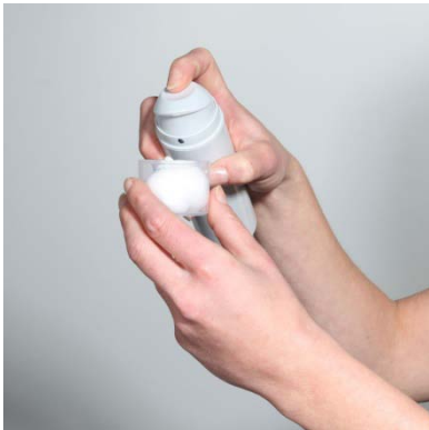
Figure D: Dispense EVOCLIN Foam into clear cap.